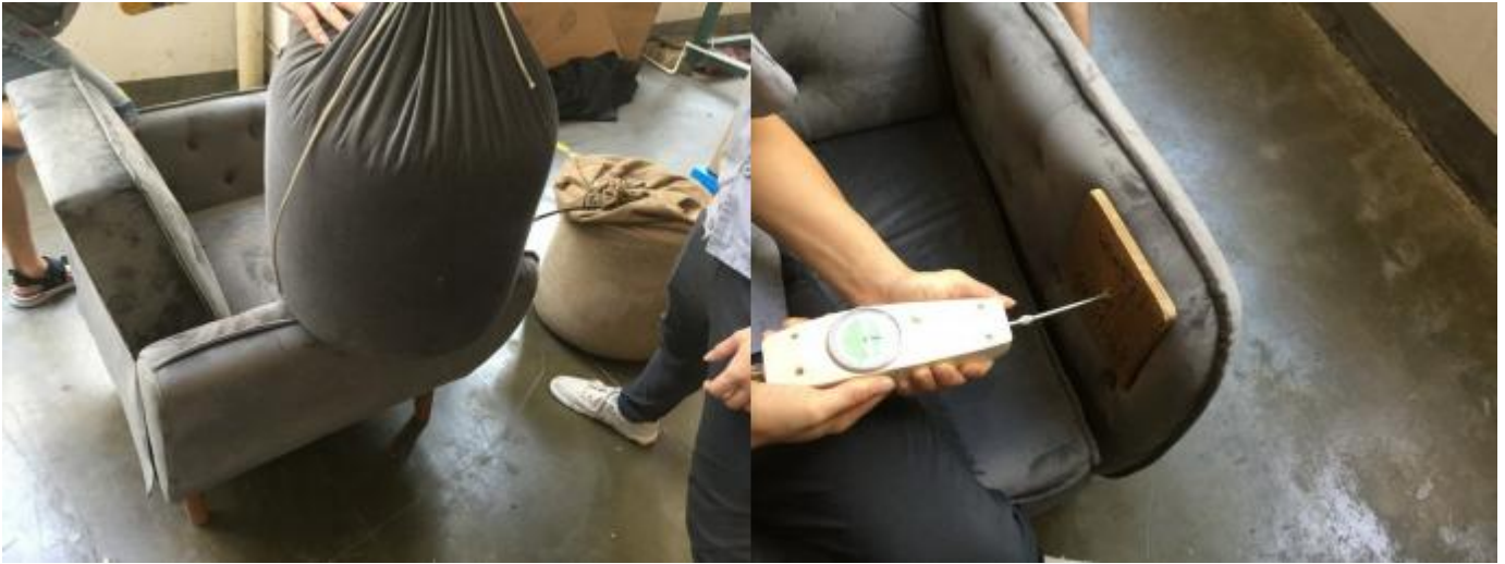
The sample passed the arm strength test successfully.