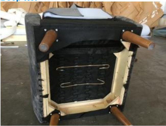
After drop test, the sample functions properly, no breakage of components was found. The drop test result is PASS.