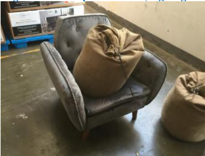
The sample passed the static load test successfully.