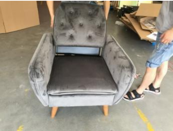
The backrest is inserted onto seat with brackets.